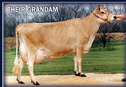
Gabys Hermitage Roxette, E-90% 4-1 2X 305 9,815 481 4.9% 362 3.7% • Eleven sons in A.I.