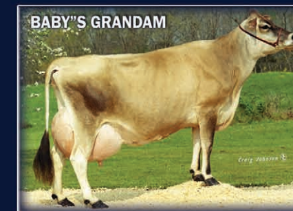
Gabys Alf Ballet, E-90% 4-11 2X 305 11,544 536 4.6% 410 3.5%