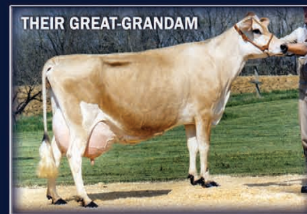
Gabys Boomer Roxy, E-91% Lifetime production: 69,036M, 3,350F, 2,469P in 9 lactations