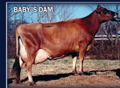
Gabys Lemvig Barbie, E-92% 6-9 2X 305 10,682 598 5.6% 386 3.6%